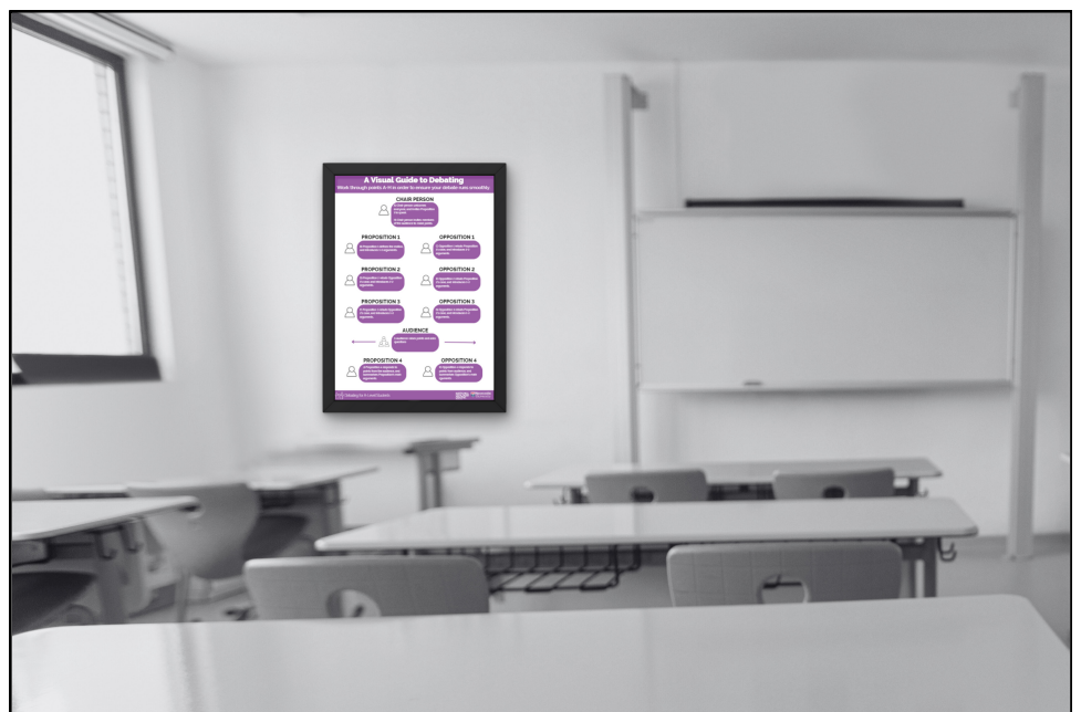
A visual guide to debating displayed in a classroom