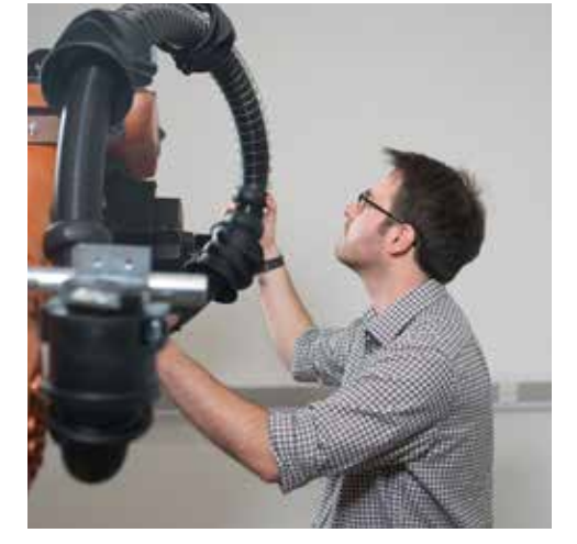
The Technician Commitment