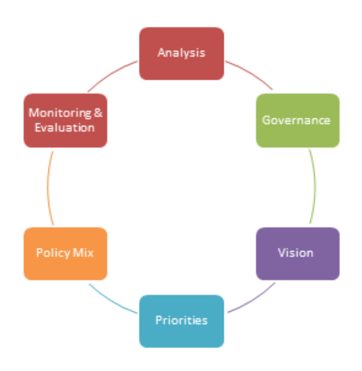
Figure 3.1: Key Steps for Delivering a Smart Specialisation Strategy

Overall a six step process is identified<sup>9</sup> for the creation of a smart specialisation strategy as demonstrated in Figure 3.1. These processes can be considered sequentially as in Table 3.2, although, in practice, as nowhere is starting with a 'blank sheet of paper', they will tend towards iterative adaption in practice.